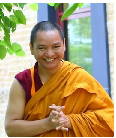
Geshe Tenzin Sherab

July 3 - 14 : The highly renowned <u>Jangtse Choje Rinpoche</u> (Gyume Khensur Lobsang Tenzin) will teach Lama Tsongkhapa's Three Principal Aspects of the Path based on the commentary by Pabongka Rinpoche.